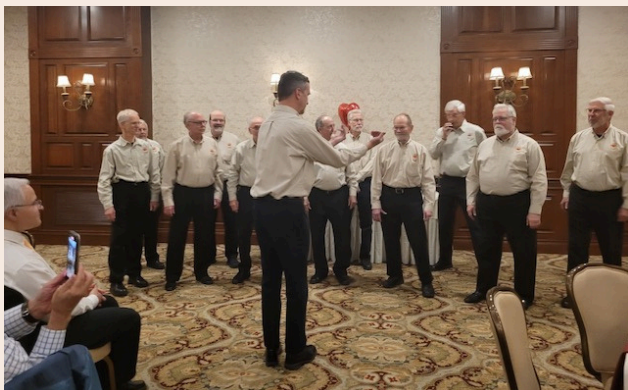
The Concord Coachmen